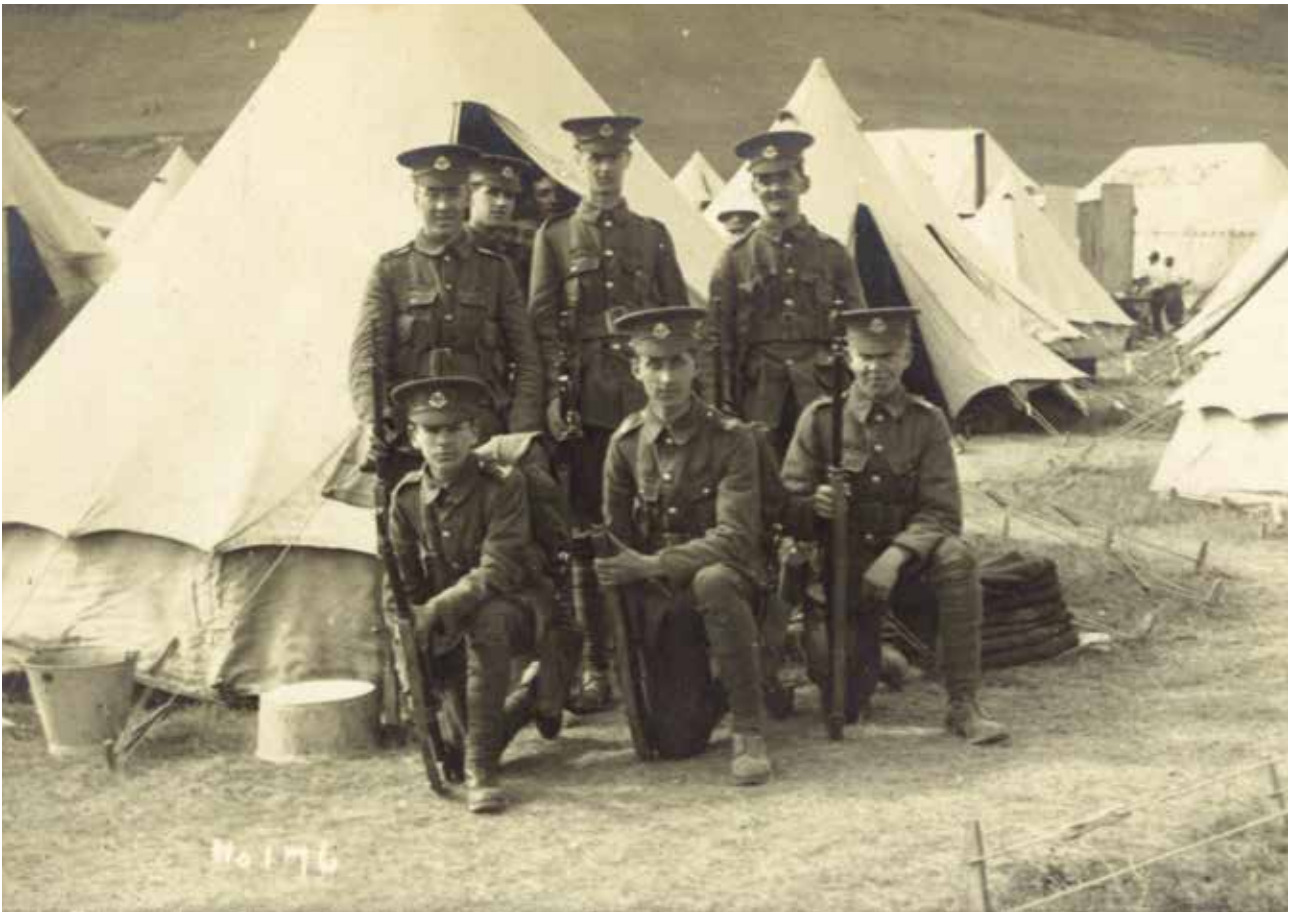
London Territorials in camp, 1910